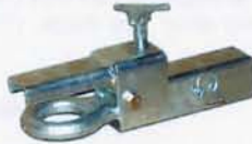
Pintle Hitch Adapter (Part # 13800)