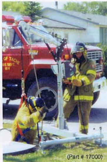
(Part # 17000)