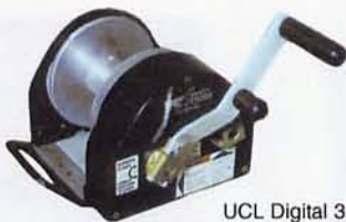
UCL Digital 300 (Part # 11649)

The UCL Digital series winches are rated for a maximum working load of 450lbs. These winches are available in 3 sizes, capable of holding up to 300 feet of 3/16" stainless steel cable or rope (not included). Digital series winches feature 2 speed silent operation, powder-coated die-cast aluminum construction, removable crank handle, carrying handle, mounting knob for quick mount plates and operators manual. (Winch mounting bracket not included.)