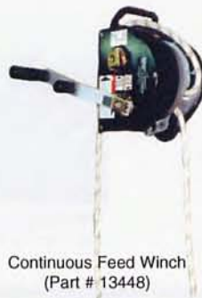
Continuous Feed Winch (Part # 13448)

The UCL Digital series winches are rated for a maximum working load of 450lbs. These winches are available in 3 sizes, capable of holding up to 300 feet of 3/16" stainless steel cable or rope (not included). Digital series winches feature 2 speed silent operation, powder-coated die-cast aluminum construction, removable crank handle, carrying handle, mounting knob for quick mount plates and operators manual. (Winch mounting bracket not included.)