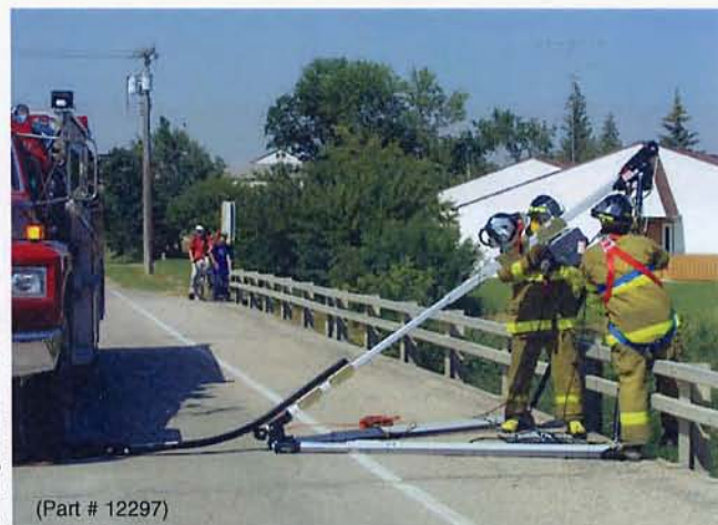
(Part # 12297)

The UCL Cantilever Rescue System kit quickly and easily converts your UCT-1000 10ft Tripod into a versatile piece of equipment for confined space entry/retrieval and rescue operations over roof edges, parapets, guard rails, cliffs or other situations. Using the wheel pad supplied with the kit, the cantilever system may be anchored with a service vehicle's weight, or with a single anchor point. Constructed of powder-coated aluminum with durable zinc plated steel hardware. The lightweight, portable cantilever kit installs and adjusts without tools.