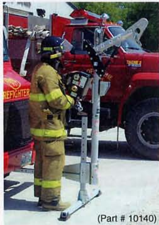
(Part # 10140)

The UCL Vehicle Hitch Mount Sleeve is designed to install into a 2" hitch receiver on an attendant vehicle to provide a portable anchor point for confined space entry/retrieval, rescue and fall arrest systems. Various sockets, extensions and accessories are available to allow use of the sleeve in a multitude of situations.