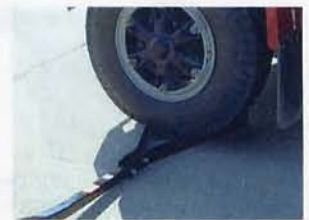
The wheel pad anchored with a service vehicle's weight,