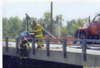
The Cantilever Rescue System in use over the side of a bridge.