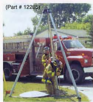
(Part # 12285)

The UCT-1000 Tripod is constructed of lightweight tubular aluminum with a rugged steel head assembly. It can be combined with a variety of pulleys, winches and fall-arrest devices to meet a wide range of confined space entry/retrieval and rescue requirements. Plastic sliders between inner and outer leg tubes provide smooth adjustment, and prevent inner tube from inadvertently pulling out of outer tube. Quick release pins positively locate components at all adjustment points for tool-less setup.