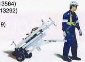
(Part # 13292)